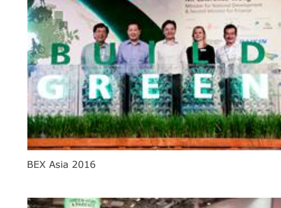
Mostra Convegno Expocomfort (MCE) Asia 2016 7 to 9

while exploring such a relevant topic around the Future of Commerce."